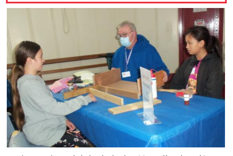
Getting creative and glad to be back at Messy Church, making a doll's bed that's still used regularly!