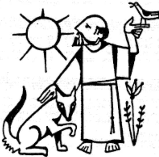
Francis of Assisi