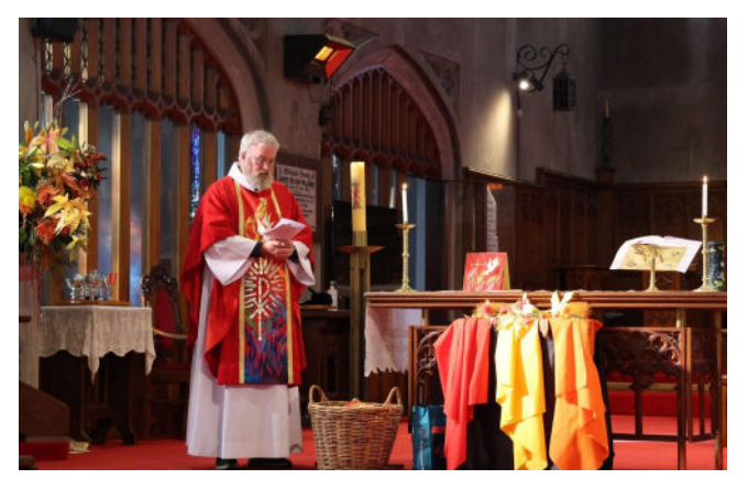
(The Vicar leads the "Liturgy of Light" to mark the end of the Easter season. - Pentecost Sunday)